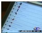
Save Money and Pounds with Online Groceries